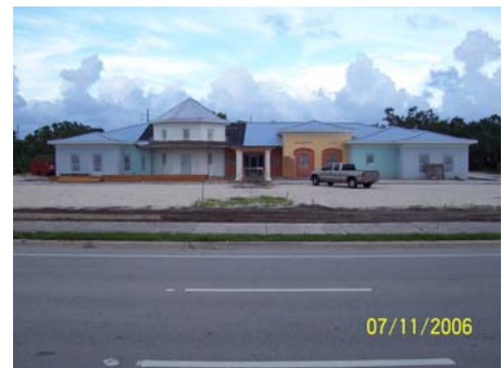
Main facade of building depicting Floridian style of architecture.