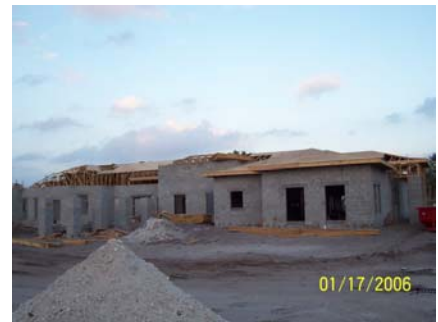
Exterior Block work complete. Beginning roof system construction.

In addition to the homeopathic treatment are basic services of routine maintenance health care, surgery, dental care and critical care. Calusa also offers micro-chipping, day care, nutritional counseling and behavioral medicine. As the ownership of exotic pets grows in popularity, Calusa Veterinary Center employs veterinarians who have experience in the care and treatment of birds, ferrets, guinea pigs, iguanas, rabbits, sugar gliders, and snakes.