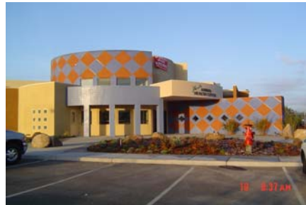
Acacia Animal Hospital

The design features seven exam rooms, two treatment rooms, two intensive care units, two isolation units, two surgery suites, plus areas devoted to radiology, dentistry, diagnostic laboratory and pharmacy.