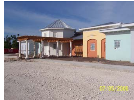
Entry Pergola with bright exterior colors.